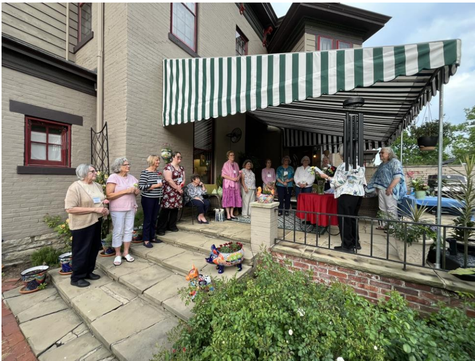
Here are the new officers who were installed at our May banquet.