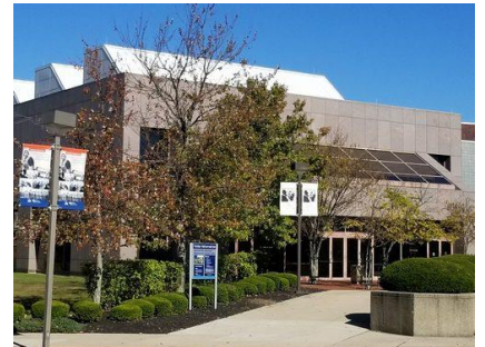
National Afro-American Museum and Cultural Center