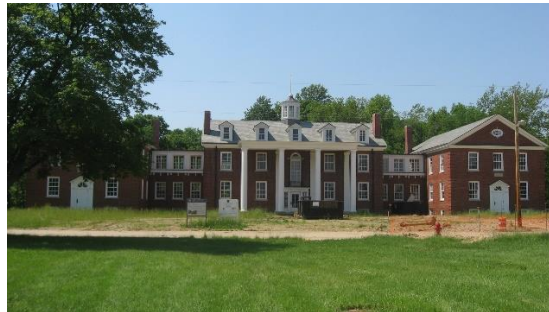
Central State University