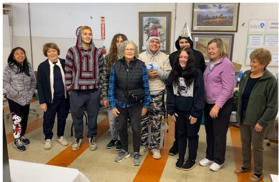
Thanks go out to AAUW volunteers and their helpers from Marshall High School in Middletown, who were busy on Nov. 15 clearing up from the sale.

More than $6,300 was generated by AAUW Middletown's annual holiday bazaar this year, held during the first two weekends in November. Generous donations of holiday items and re-giftable presents dazzled shoppers who loaded up on affordable indulgences for friends and family.