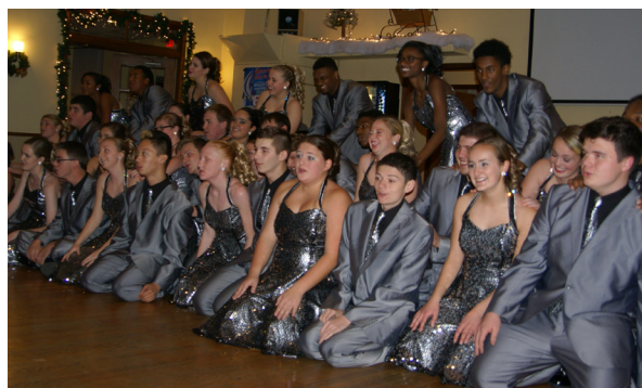
The Purple Pizazz Show Choir from Middletown High School performed for members at the December meeting.

Thank you to each member who coordinates and leads these branch activities and to all the members who participate.