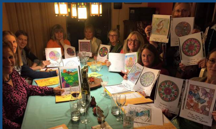
The Colorado Book Club shown above.