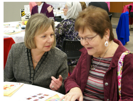
Several members enjoyed Women Enriching Lives’ Luncheon supporting Dolly Parton’s Imagination Library.