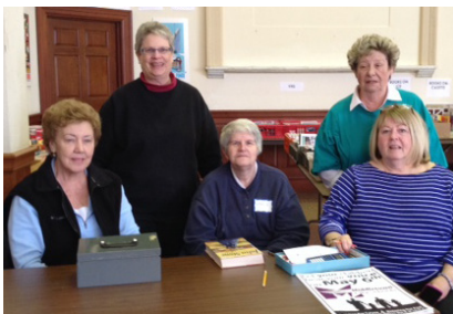
Saying farewell to our Main Street Book Sale site at this month’s Moving Sale.

STARZ Award: This is a “best practices” award designed to increase communication between branches and with the State Board. It also helps branch leaders and members become aware of and contribute to the goals of AAUW. There are 4 basic requirements and, then, the opportunity to earn 9-14 “glitter points.” By having representatives at both the 2013 state convention and leadership conference and by submitting our branch dues and officer lists on time, we were eligible to compete for “glitter points.” AAUW Middletown earned 11 of the maximum 14 for being represented at the 2013 national convention, having a minimum of 5 meetings/programs during the year, having at least 2 meetings on AAUW issues, submitting our branch program book to state Program VP, having a Public Policy chair, publishing 3 or more newsletters, collaborating in a state project (Be WISE Camp scholarship), collaborating in a community-based project (local scholarships, Dolly Parton Imagination Library, Light Up Middletown), having a website and Facebook page, increasing membership, and participating in local arrangements for the 2014 state convention. As you read through this list, think of where and when YOU helped AAUW Middletown reach for the STARZ - and thank you!